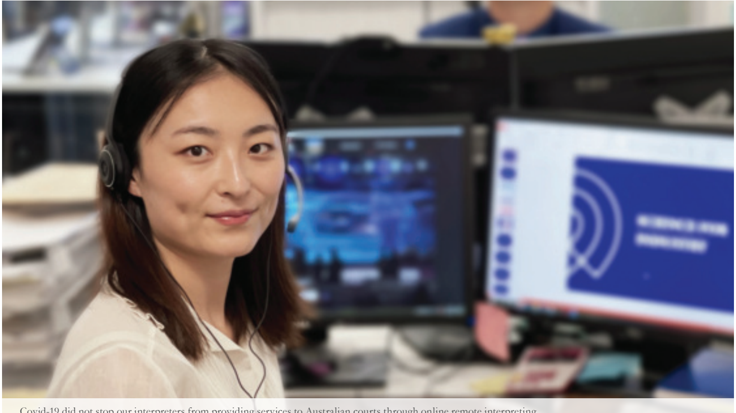
Covid-19 did not stop our interpreters from providing services to Australian courts through online remote interpreting

Whatever language we speak, we know the importance it plays in the courtroom. Smooth talking barristers use language as a tool to win a battle, but employing intonation, leading questions, and double negatives will not elicit the required response if the client doesn't speak English well. It is highly risky and your well-prepared case is going to unravel.